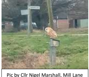
Edition 5 - June 2024

Have you got a photo you would like to see in the newsletter, send us your best ones!