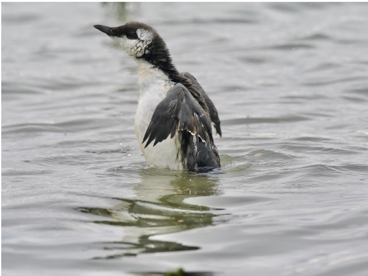
Guillemot