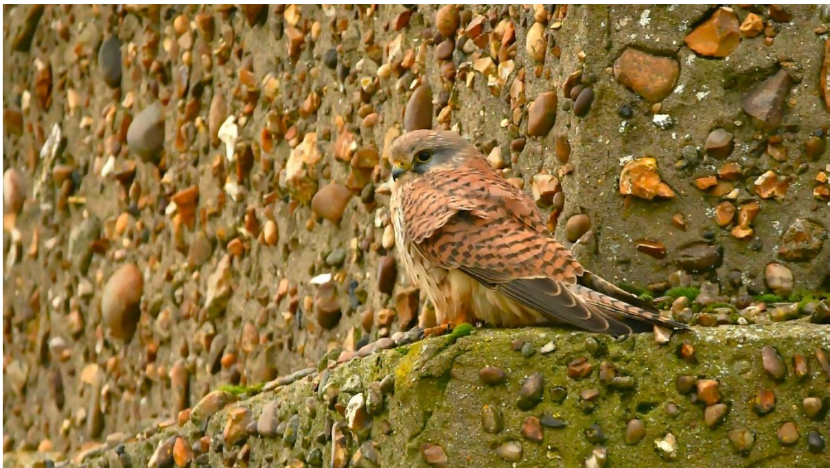
Kestrel

All the photos below were taken in the last few months at Freiston Shore.