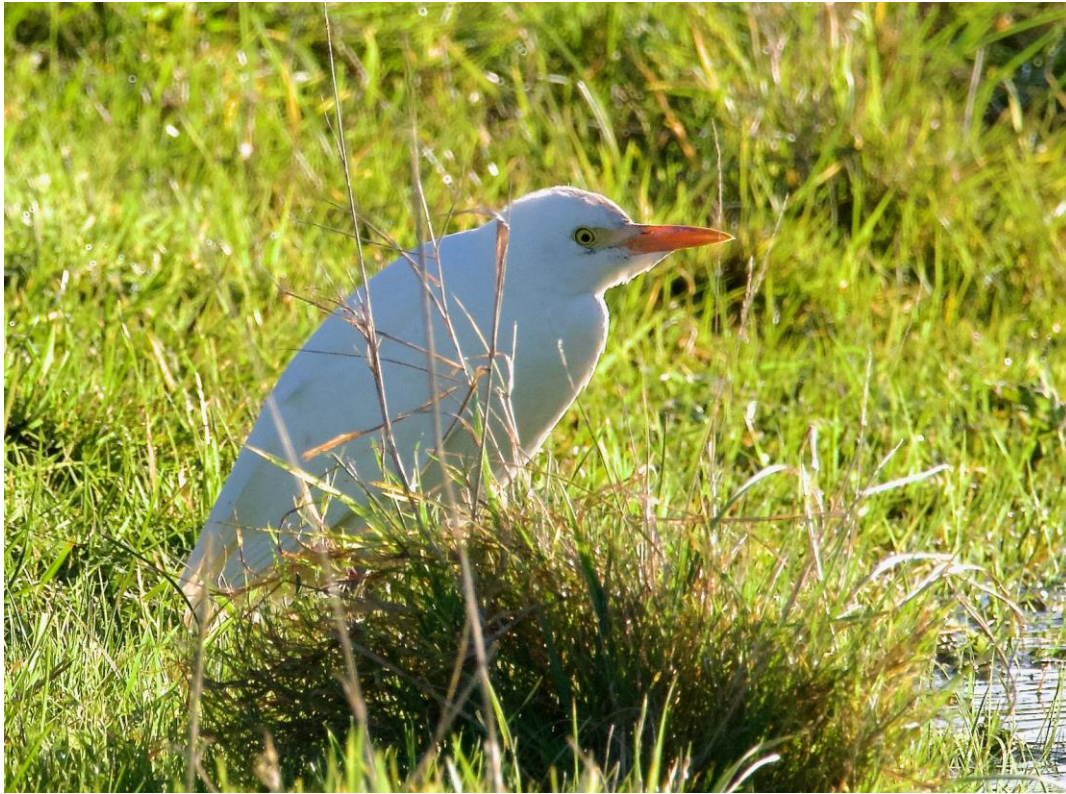
Cattle Egret