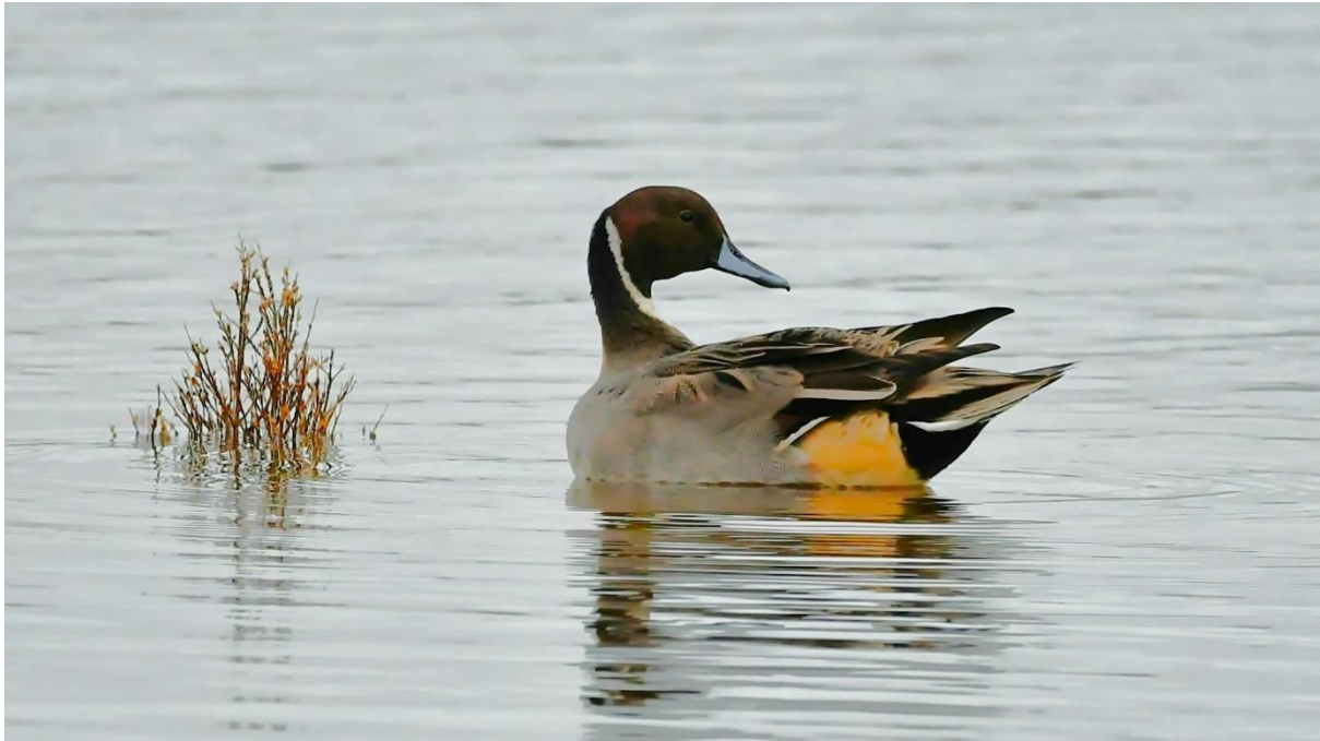
Male Pintail